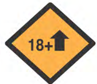
Only Accepts Adults