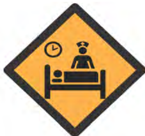
Offers Inpatient Treatment