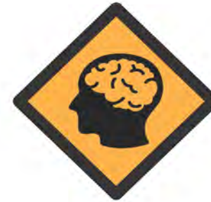
Offers Mental Health Treatment