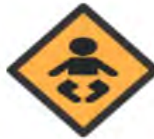
Child Services Provided