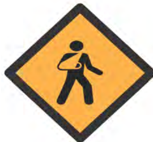
Offers Outpatient Treatment