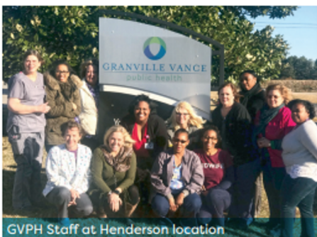
GVPH Staff at Henderson location