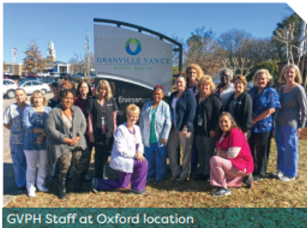
GVPH Staff at Oxford location